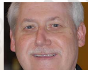
PAUL D. WEBER HYMN FESTIVAL

CELEBRATING THE 500TH ANNIVERSARY OF THE FIRST LUTHERAN HYMNALS