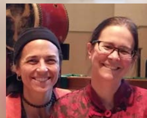
THUNDER AND WIND