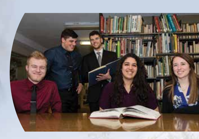
LCEF: Marketing team for CUCBusiness

among the top business leaders and educators in the nation. CUCBusiness can help you achieve your professional goals through ethical leadership in a global business community.