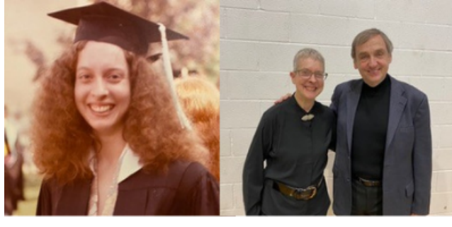
Graduation, May 1975